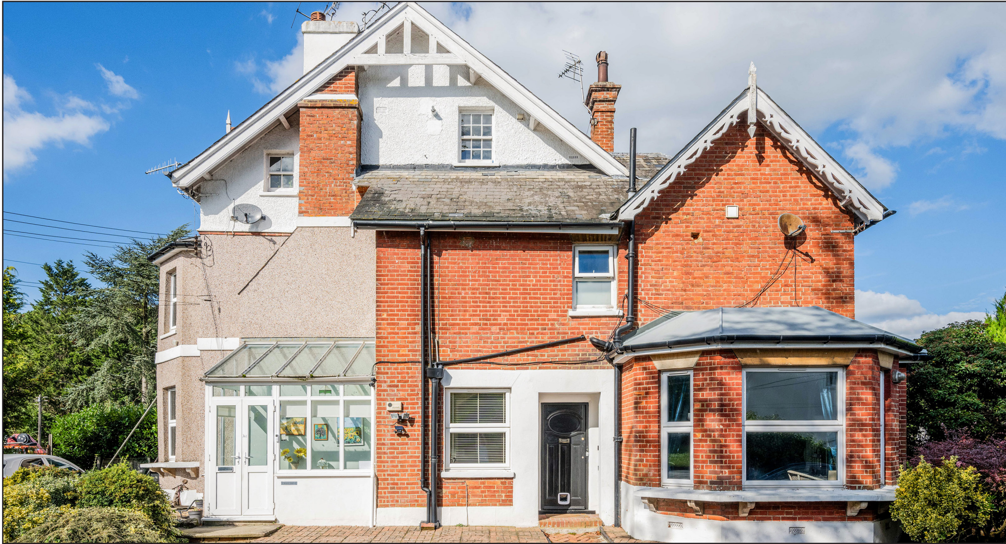
Marle House, Blindley Heath